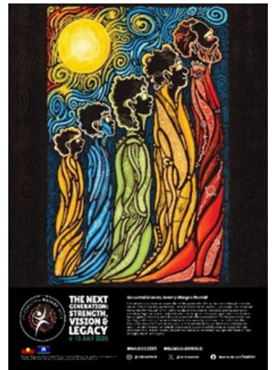
The 2025 National NAIDOC Poster incorporating the Aboriginal Flag and the Torres Strait Islander Flag (licensed by the Torres Strait Island Council).