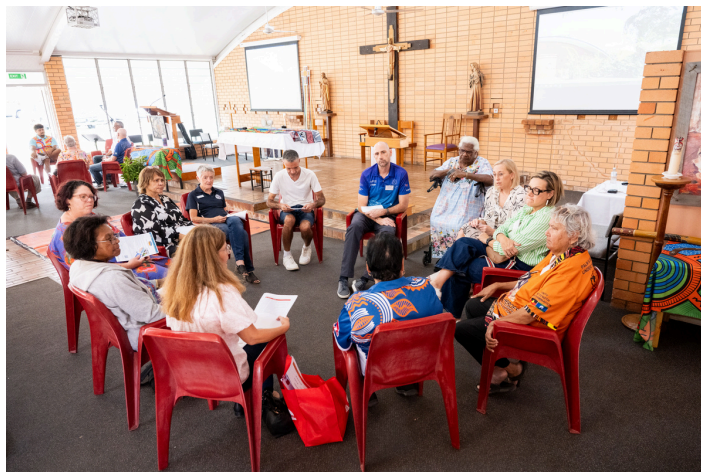
5 th Annual First Nations Encounter day